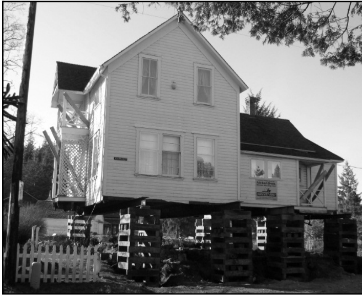
Rays of sunlight hit the underside of the King house for the first time in 115 years.

Earlier this year the James King farmhouse was slowly lifted off of its 115-year-old foundation that had seen better days. The original foundation of cedar logs and fieldstone was failing from dry rot and structural problems had begun to develop. At a rate of one foot per 45 minutes, the house was raised nine feet. Four feet of soil was then excavated and after a months time, the house gently came to rest on a new solid foundation.