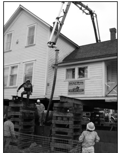
Cribbing and steel beams supported the house during the project.