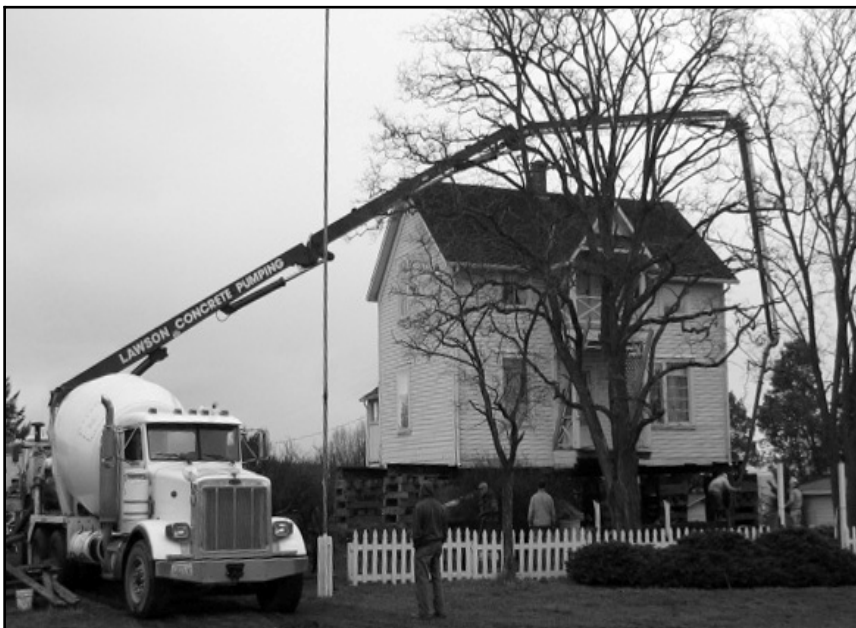
Concrete being pumped for the new foundation.